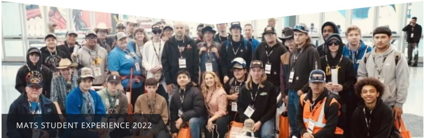
MATS STUDENT EXPERIENCE 2022