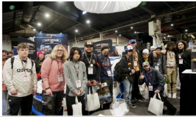
The Mid-America Truck Show scavenger hunt was a huge success in 2022.