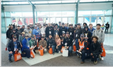
The Mid-America Truck Show scavenger hunt was a huge success in 2022.