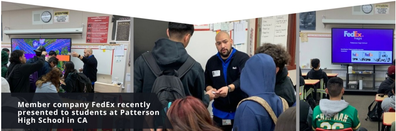
Member company FedEx recently presented to students at Patterson High School in CA