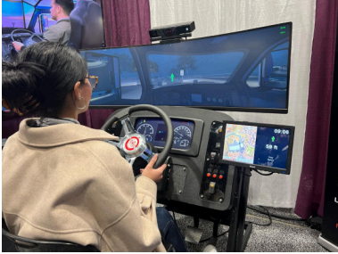
(Above) Student practice with simulator