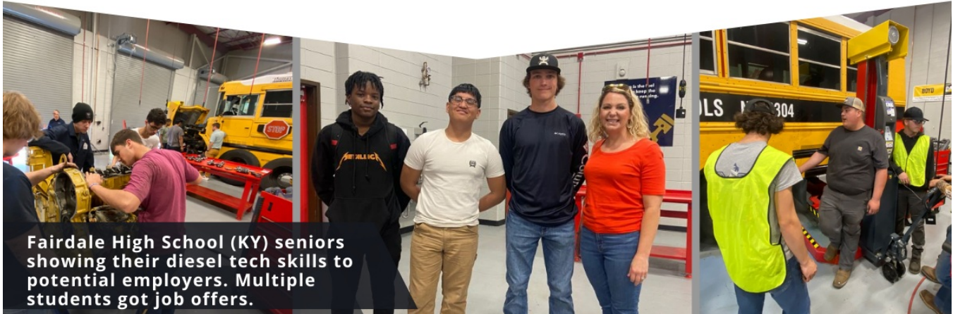
Fairdale High School (KY) seniors showing their diesel tech skills to potential employers. Multiple students got job offers.