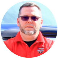
Ray Clark Truck Country/Stoops