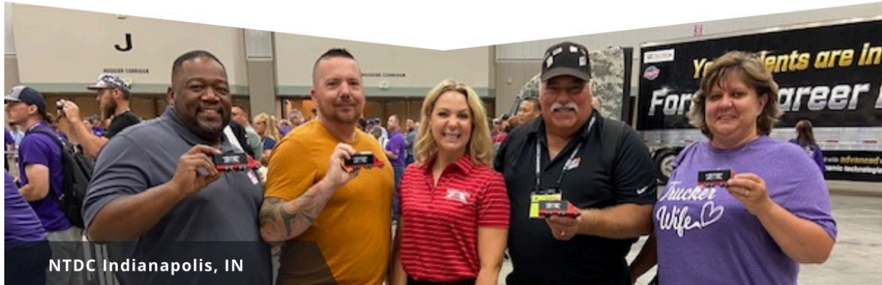
NTDC Indianapolis, IN